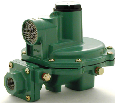
Figure 2. Type R652 Second-Stage Regulator