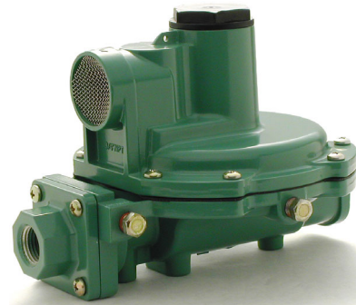
Figure 1. Type R622 Second-Stage Regulator