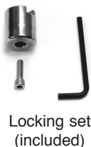
Locking set (included)

STEAMIX Model 2033 includes 25 feet of "safety yellow" washdown hose, rubber cushioned spray nozzle with swivel adapter and a stainless steel nozzle hook.